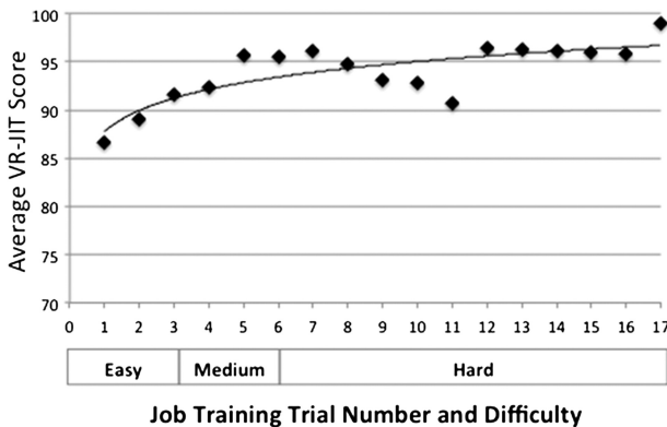
FIGURE 2. VR-JIT learning curve in adults with a psychiatric disability. This figure plots the mean score for each successive VR-JIT simulated interview trial. Trials 1 to 3 at easy, trials 4 to 6 at medium, and trials 7 to 17 at hard. Model fit, R^2 = 0.65 .

significant (VR-JIT slope shifts upward) and the baseline difference is reduced. Although the subjects were randomly assigned and multiple baseline measures were obtained in an effort to prevent such threats to internal validity (Barnett et al., 2005), this finding must be interpreted with caution. Thus, it is possible that VR-JIT does not have a strong effect; however, future research with a larger sample would be needed to evaluate this issue more carefully.